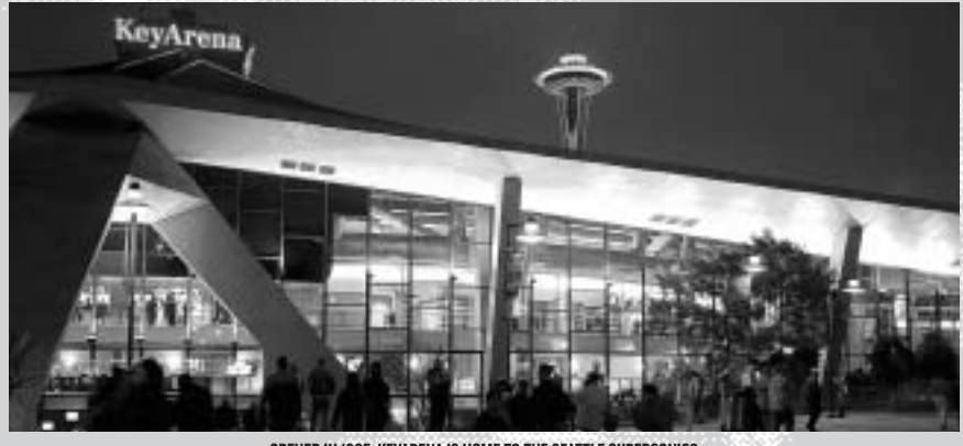
OPENED IN 1995, KEYARENA IS HOME TO THE SEATTLE SUPERSONICS.